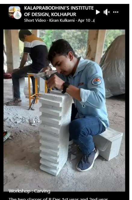
The two classes of B.Des 1st year and 2nd year enjoying a session of carving on AAC Block as a part

Workshop : Carving The two classes of B.Des 1st year and 2nd year enjoying a session of carving on AAC Block as a part